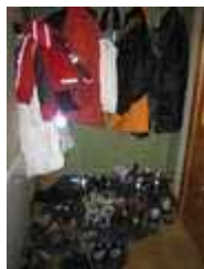
shoe collection at the entrance

This year, we unseasonably hadn't snow at the end of December. However, the camp was fully booked and the main building full of nice people. We had a party until the early morning and much to talk about.. At midnight, we had some very nice fireworks - greatly to watch thanks to the clear nightly sky.