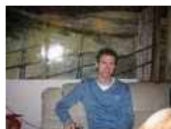
A quiet minute...