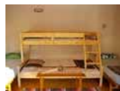
New bed in cottage no. 6.