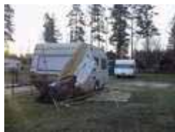
Result of one of the three winter stormes - fortunately fixed within 30 minutes.