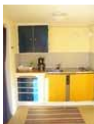
The kitchen in cottage no. 1,...

Cottage no. 1 became totally renovated this autumn and now shines brightly in fresh yellow and blue colours. Many thanks to Jörg who did a great job and choose a new inhouse design. Cottage no. 6 is now equipped with a wider and comfortable bed.