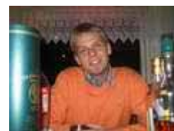
Good whiskey is a pleasure!