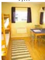
...from different points of view.