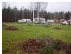
Unusual warm weather without frost in December - it was even possible to rake the leaves.

Not only in Middle Europe the weather went crazy this winter. Even in Torsby, the seasonal temperatures were all too high - normally, we would have snow in November. On January 20th, everything went back to normal and we had some 20-30 cm of fresh snow, followed by sinking temperatures around -10° bis -24° Celsius (with lots of sun!). Now, all kinds of winter sports like skiing or ice fishing are possible without restrictions.