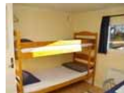
...and the combined eating and sleeping room,...