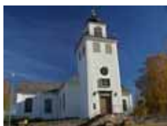
The church in Vitsand...

Autumn brought us wonderful leaf colours and fine weather. We had marvellous hours out in the nature and explored the surroundings at this late time of the year. Bright sunrises helped to get up early in the morning and a relaxing visit in our sauna warmed our tired bones in the evening. At the end of October, the first snow remained on the camp for a couple of days - time to prepare the snowblower for the winter season.