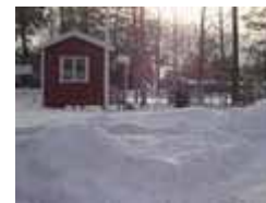
On January 20th, we finally receive a higher amount of snow and falling temperatures.