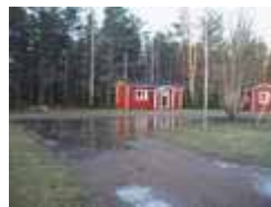
Mid of January: rain cannot drain. Due to the iccold soil it freezes to large lakes on the camp.