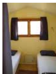
...the separate sleeping room...