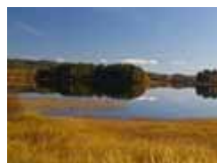
...and the neighbouring lake shore.