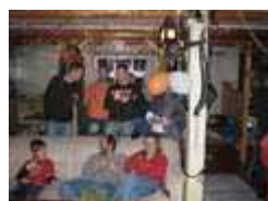
We jointly watch "Dinner for One" ...