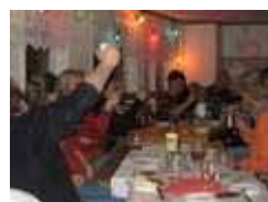
...in both rooms of the main building.