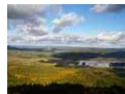
The view from the Hovfjäll mountain onto lake Övre Brocken...