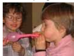
Such a balloon is quite hard to inflate.