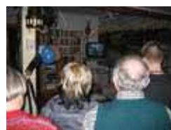
... this movie will certainly become a New Year's tradition on Camping45.