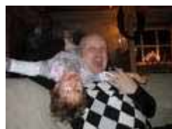
...followed by wild playing